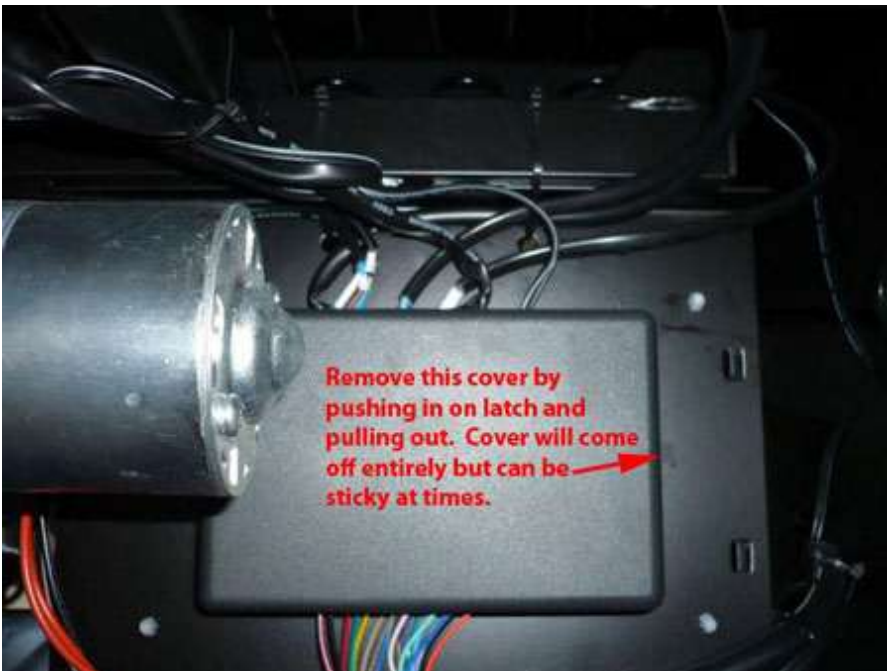
The circuit board will look like this.